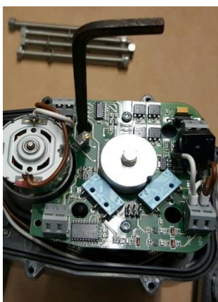
Step4: Unscrew the 4 Hex Head screw holding the motor to the valve body