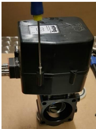
Step3: Remove the eight Torque screws retaining the motor cover