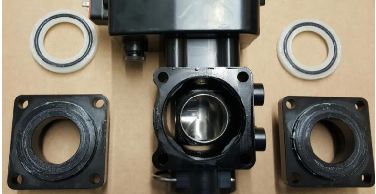
Step 2: Remove the Flanges and seals