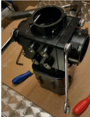
Step 1: Remove the four retaining bolts on the port flanges