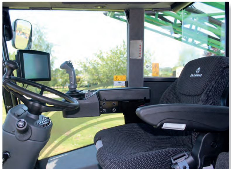
Panoramic, air conditioned, ergonomically designed cab

Ride quality and comfort are second-to-none. The renowned AIR RIDE self-levelling suspension system smooths out even the bumpiest terrain, increasing stability whilst reducing machine and operator fatigue.