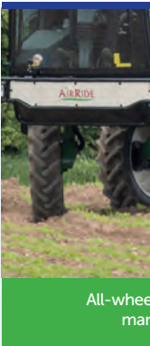
All-wheel drive ensures maximum traction