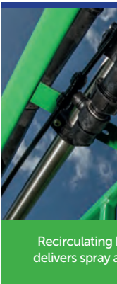
Recirculating spray system delivers spray accurately