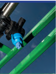
boom system instantly at the required pressure