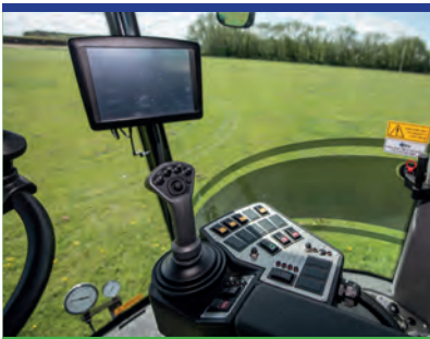
All essential sprayer functions at your fingertips with Total Machine Control (TMC)