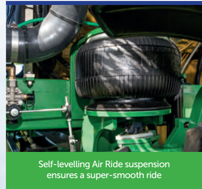
Self-levelling Air Ride suspension ensures a super-smooth ride