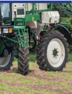
el steer for superb manoeuvrability