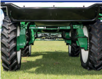
Clearance up to 100cm on standard models and up to 175cm on specials