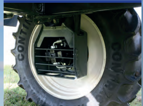
Sauer Danfoss wheel motors for increased power and reliability