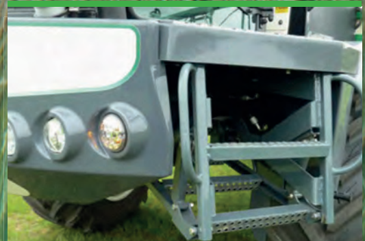
Safety steps and excellent all-round lighting