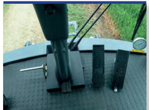
Foot throttle and brake standard