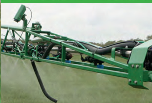
Optional ultra-sonic boom levelling