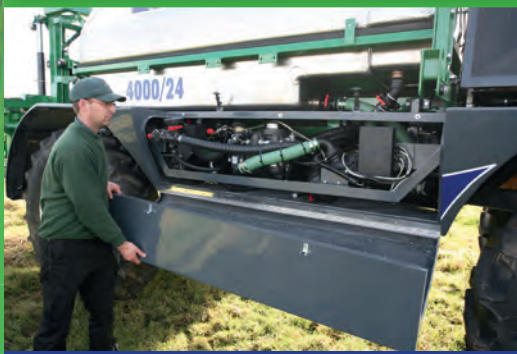
Quick, easy access to reduced plumbing system