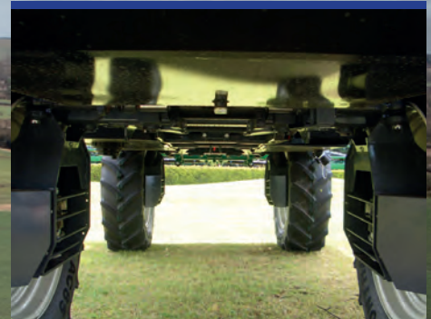
Unobstructed underbelly and higher ground clearance