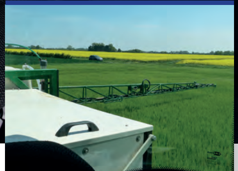
Excellent views of boom from the panoramic cab