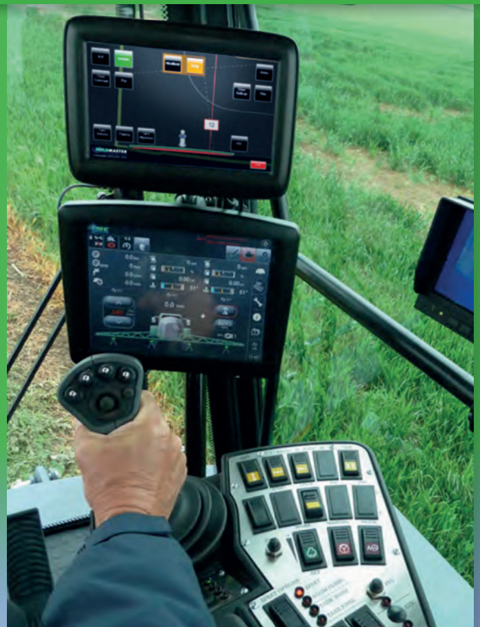
Fully integrated TMC control unit and FieldMaster GPS mapping system

FieldMaster provides Field Mapping with exceptional accuracy, together with Light-Bar Guidance and Auto-Section Control in one user-friendly, touch-screen unit and is fully compatible with YARA N SENSOR, Farmade and SOYL mapping. Designed specifically for Househam sprayers, FieldMaster synchronises seamlessly with Househam's controls and other systems.