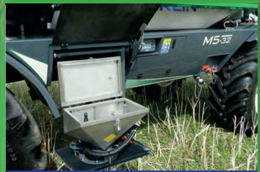
Safe, easy-to-use hopper and controls