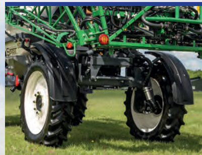
High ground clearance