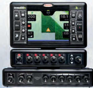
Continuous real-time information on valve status relayed to Bravo 400S controller via Can-Bus.

The SPiRiT is available with Seletron - a cutting-edge electronic shut-off nozzle valve that, applied to ARAG nozzle holders and integrated with the GPS-linked Bravo 400S controller, allows the separate control of every single nozzle in up to 13 boom sections. The system automatically shuts off each individual nozzle to avoid spray overlap and selects the most suitable nozzle according to spray rate and speed, maximising spraying precision and minimising waste.