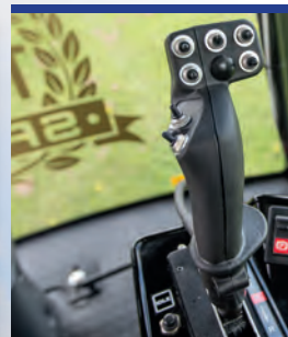
Easy operation of spray from spray control