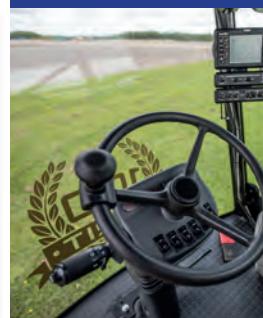
Air conditioned, ergonomic cab with user-friendly layout, radio, CD and fold-down