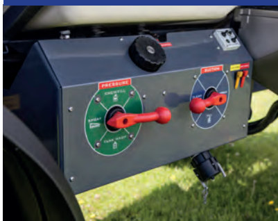
Plumbing system designed for easy filling and washing out