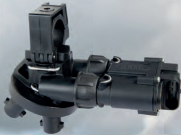
Dual or quad nozzle set-ups reduce boom pressure and drift