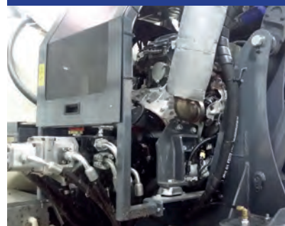
New, highly efficient MTU engine offers easy access and is rear-mounted for a quieter cab