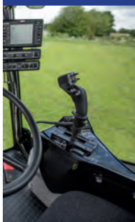
Ergonomically designed layout and controls, down buddy seat