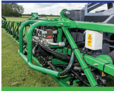
Pantograph arms ensure precise spraying height