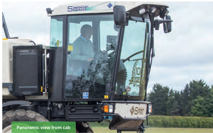
Panoramic view from cab

Quiet running, with reassuringly solid stability thanks to the well-balanced boom and a near-perfect 50/50 centre of gravity, the SPiRiT is a joy to work with. Easy-to-use controls within the superbly appointed, ergonomic cab are all positioned just where you'd want them to be and panoramic vision gives a good view of the boom at all times.