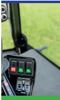
Spray functions control unit