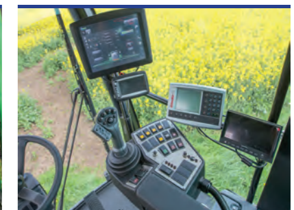
The quiet, spacious and luxuriously appointed cab is ergonomically designed to enhance operator comfort.