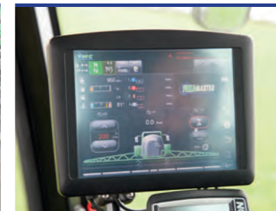
Househam's advanced TMC V5 controller and FieldMaster GPS system are included as standard.