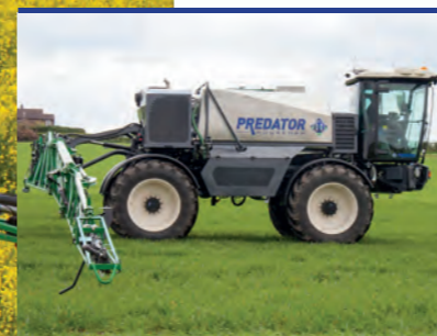
PREDATOR utilises Michelin 380/90 R46 rowcrop tyres or, as shown here, a 650/60 R38 low ground pressure option.