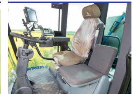
High back Grammer air suspension seat plus fold-away buddy seat.