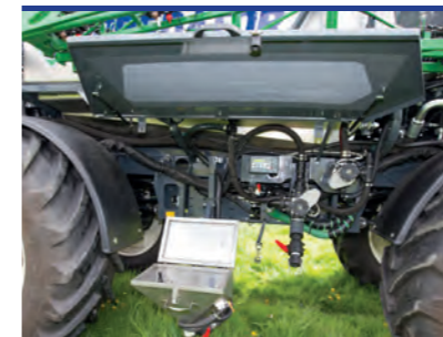
Easy-to-access side fill area, chemical induct at infill monitor and chemical hopper.