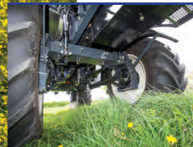
The 4-link fully active hydraulic suspension system is specially designed for the PREDATOR .