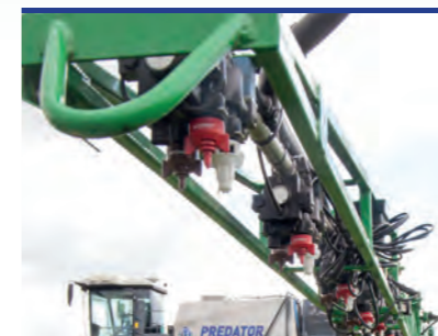
Individual Nozzle Control for superb spraying accuracy and adaptability.