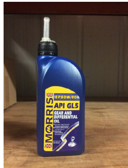
Figure 2 - EP80W-90 Gear Oil. Part Number - 9950060013

In order to change the oil in a reduction hub on a wheel motor, firstly ensure that the three plugs are in the correct position as seen in the above figure, by driving the sprayer, consequently rotating the wheel motor, so that the drain plug is at the 6 o' clock position. The plugs can be removed with an 8mm Allen key. Remove the drain plug to let the old oil out, and replace plug when empty. Now remove the level and fill plugs with the 8mm Allen key, and pour the new oil in through the fill opening, stop once the oil begins to flow back through the level plug. We recommend EP80W-90 Heavy Duty gear oil for these reduction hubs. Replace the plugs into the correct locations, and repeat with each hub. Ensure that the next hub is aligned correctly so that the drain plug is at the 6 o' clock position again before changing that oil.